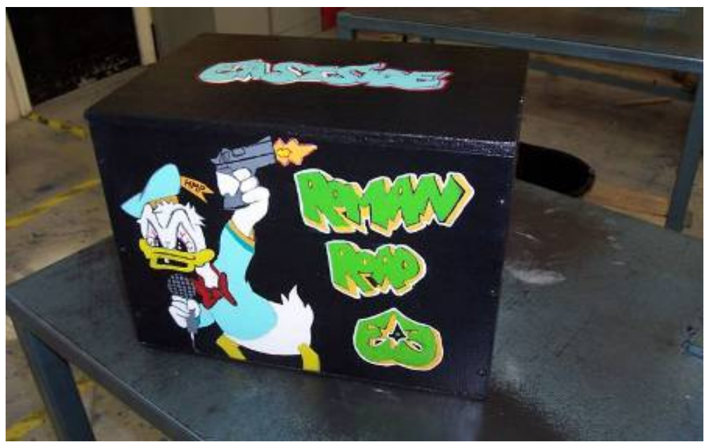
A wooden box made in HMYOI Rochester declaring the postcode local affiliations of its maker.